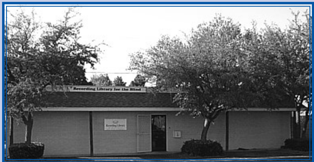
Our current location on Cuthbert, across from Midland Memorial Stadium